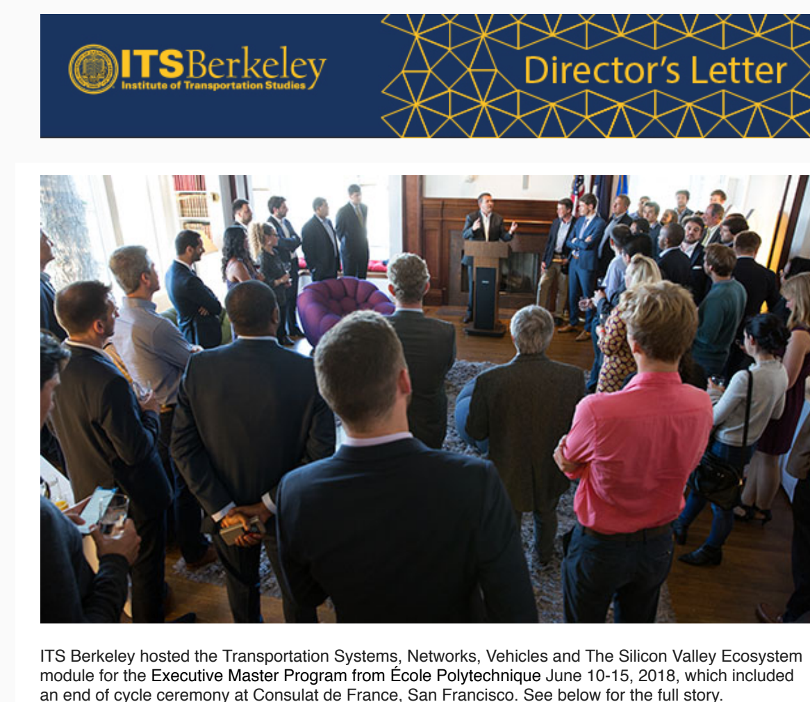
module for the Executive Master Program from École Polytechnique June 10-15, 2018, which included an end of cycle ceremony at Consulat de France, San Francisco. See below for the full story.