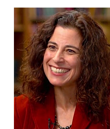
Published New <u>Articles</u>