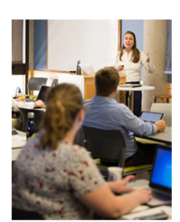
École Polytechnique Executive Master Comes to ITS <u>Berkeley</u>