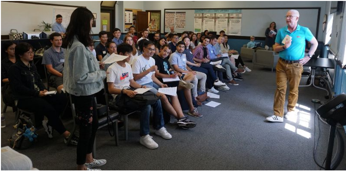
ITS Berkeley welcomed a new batch of students at the Transportation Engineering orientation on August 26, 2019.