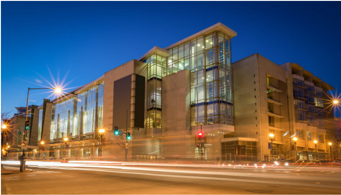
The Institute of Transportation Studies Berkeley will be well represented at the upcoming National Academies of Medicine Engineering and Science's Transportation Research Board Annual Meeting in Washington D.C. January 12-16, 2020.