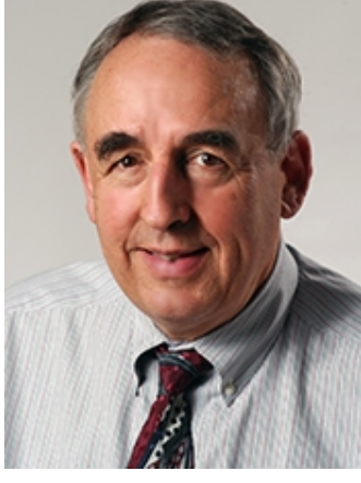
Ragland Named in 75 Most Influential SPH Alumni