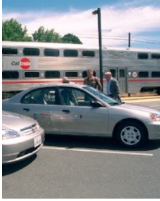
Transportation Sustainability Research Center Releases Carsharing Market Outlook