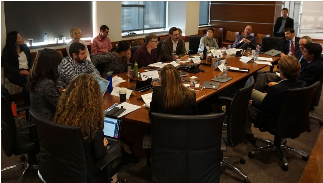
Several leaders and researchers from ITS Berkeley and ITS Centers met with Legislative Staff to discuss ongoing innovative research happening on campus and how the state can work with ITS Berkeley on Nov. 6, 2019.