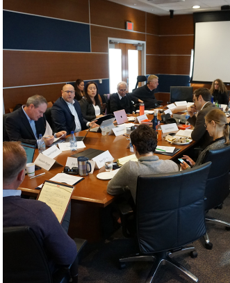
Legislative Staff Talk ITS Research