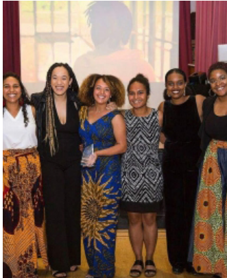
ITS/CED Students Honored for Self-eSTEM Work