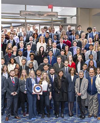
11 ITS Students Earn Eisenhower Awards