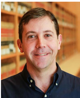
Electric Vehicles and Global Urban Adoption Policy Solutions from France and California