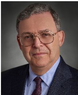
Look Who's Driving